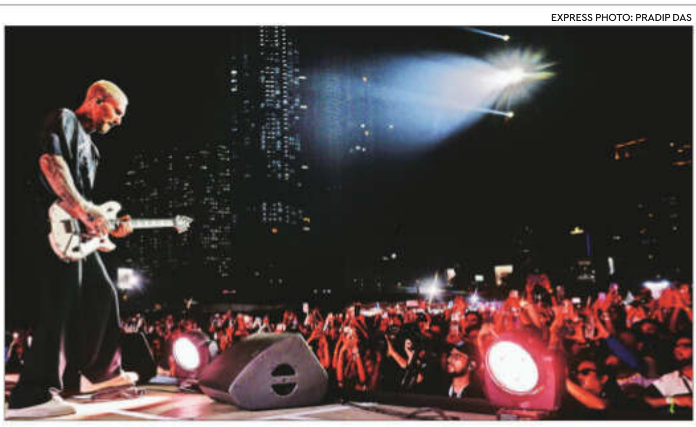
Maroon 5's Adam Levine seen at the band's debut India performance in Mumbai on Tuesday