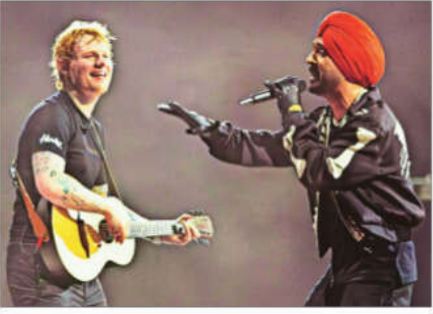
Ed Sheeran, seen with Diljit Dosanjh, had a sold-out concert in Mumbai in March. Sheeran is set to return to India in 2025

GIVEN THE EVOLVING GLOBAL dynamics, India is the new kid on the block which is opening to the world of 'experience economy'. A host of music concerts have been announced with some global artistes like Maroon 5, Green Day, Shawn Mendes, Louis Tomlinson coming for the very first time. Other artistes like Coldplay, Dua Lipa, Ed Sheeran are playing once again in India. This frenzy has also pushed local performers like Diljit Dosanjh to the forefront. The rise in disposable income has resulted in the significant demand surge for such concerts in India. The direct and indirect spending on these concerts spanning around two-three months will provide a major boost to the overall spending and consumption